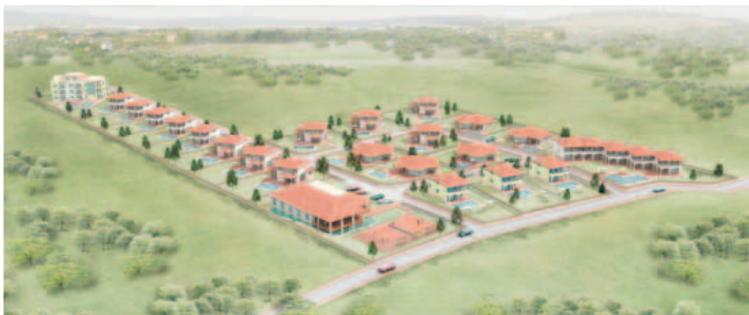
Aerial view of the Golden Hills complex.