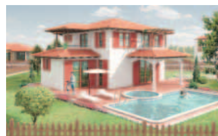
Rositza 3 bedroom villa.