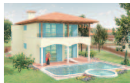
'Denitza' 2 bedroom villa.