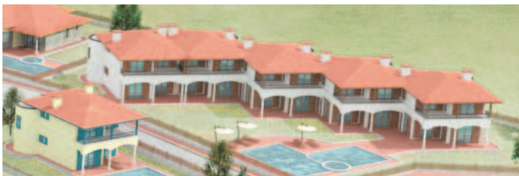
Complex of 2 bedroom 'Denitza' style villas.